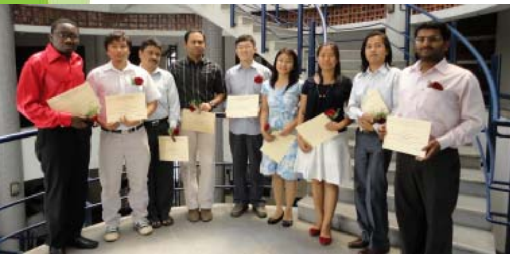
PG Diploma Course - 2010-11 graduates