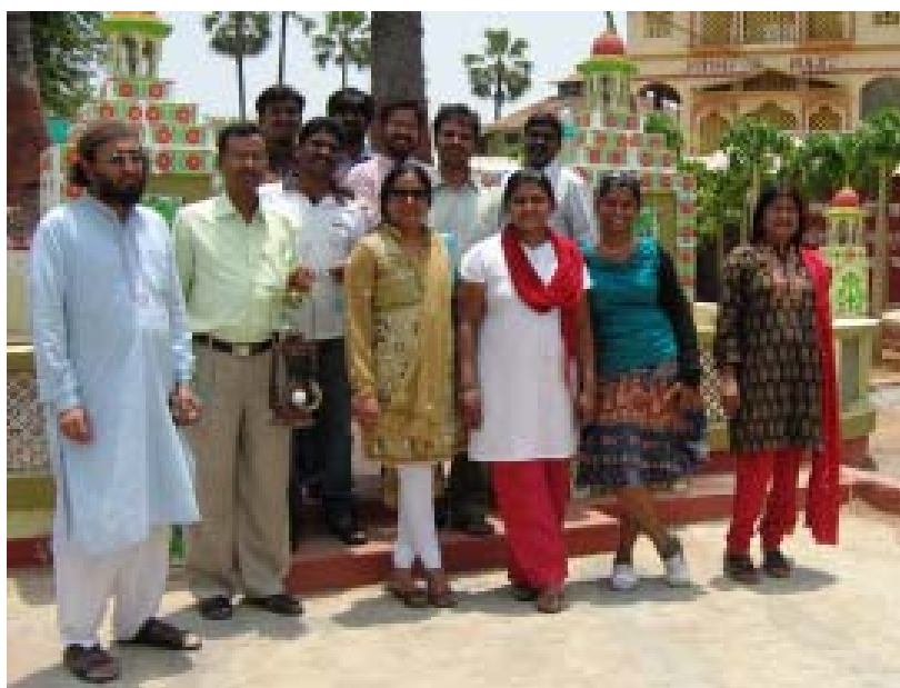
Summer Course students with faculty

Intensive Language Programme/ Summer Intensive Language Programme (SIL): The ten-week intensive language course is designed to train international students in Urdu, Persian and Arabic. This year one student from Germany enrolled for a short term Arabic language course as part of her sabbatical at HMI.